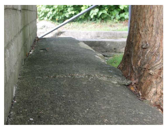
Tree up against Rear Wall

The movement could be stabilised by the removal of the tree but the Borough Engineer could give a more definitive answer.