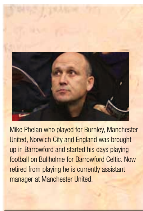
Mike Phelan who played for Burnley, Manchester United, Norwich City and England was brought up in Barrowford and started his days playing football on Bullholme for Barrowford Celtic. Now retired from playing he is currently assistant manager at Manchester United.