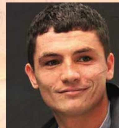
Jody Latham grew up in Barrowford. He has starred in various television series including Eastenders, Shameless and as the cheeky Callum in The Fixer.