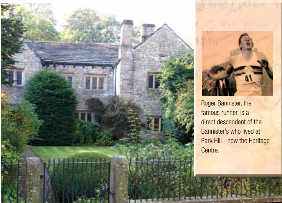
Roger Bannister, the famous runner, is a direct descendant of the Bannister's who lived at Park Hill - now the Heritage Centre.