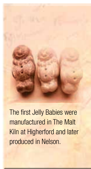
The first Jelly Babies were manufactured in The Malt Kiln at Higherford and later produced in Nelson.