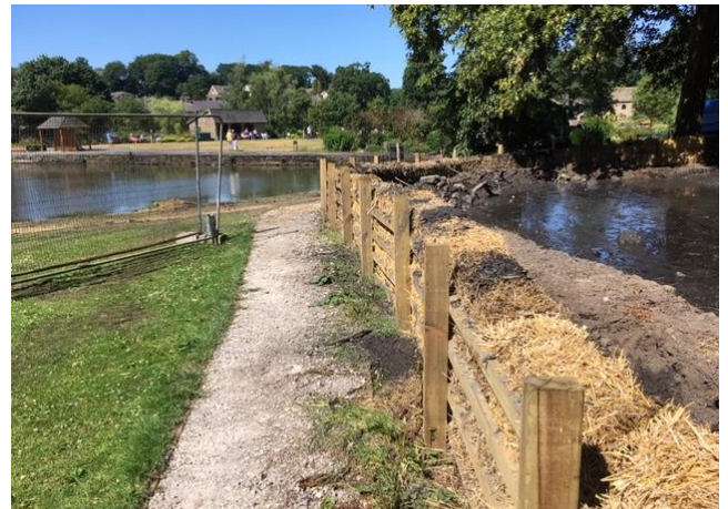
Bund Wall (above); Silt Extracted (below)