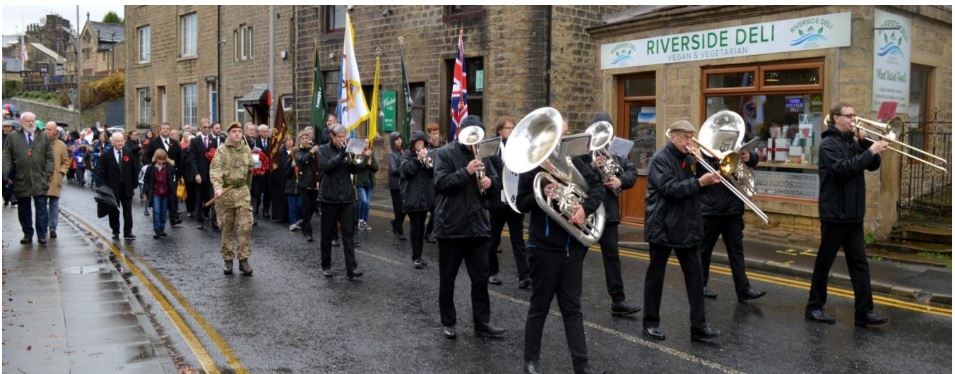
The Parade proceeding along Gisburn Road to the War Memorial