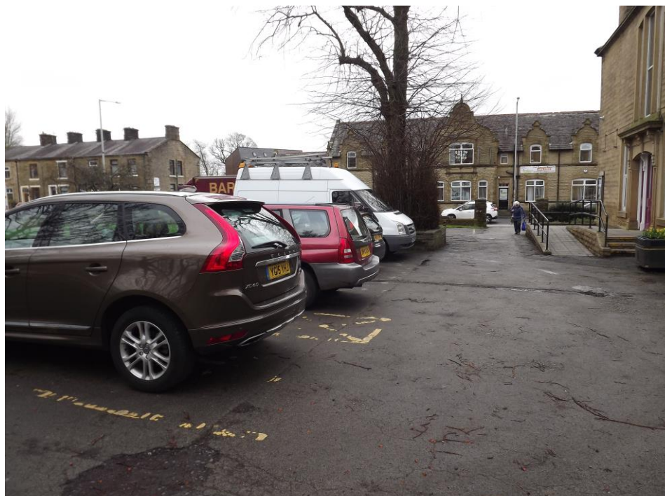
10.30am Wednesday 22 nd February, Car Park Full with visitors to the Royal British Legion, No users in Holmefield House

Increased community use at Holmefield House and the Royal British Legion Office have highlighted the inadequacies of the current parking arrangements. The lack of on street parking around the area has led to problems when either two activities are carried out simultaneously or a large activity or function is taking place. The Council considers that the activities at Holmefield House should not adversely impact on local residential parking.