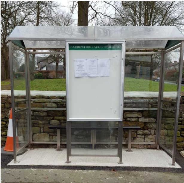
Replacement Shelter Installed

Pendle Borough Council resolved in 2016 to discontinue both new provision of bus shelters and maintenance of existing ones throughout Pendle.