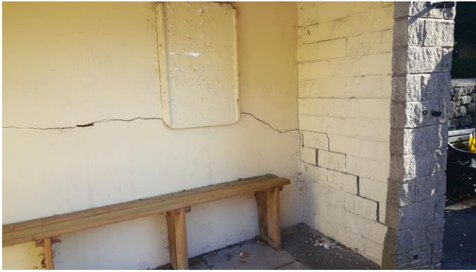
Structural Damage to the Shelter